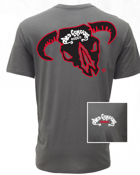
HT1831DKGY - Dark Grey 100% COTTON 1600/3200 S-XXL (1-2-3-2-1) 1600/3200 XXXL YOUTH HT1831DKGY-Y 1250/2500 XS-XL (1-2-2-2-1) 50% COTTON / 50% POLYESTER