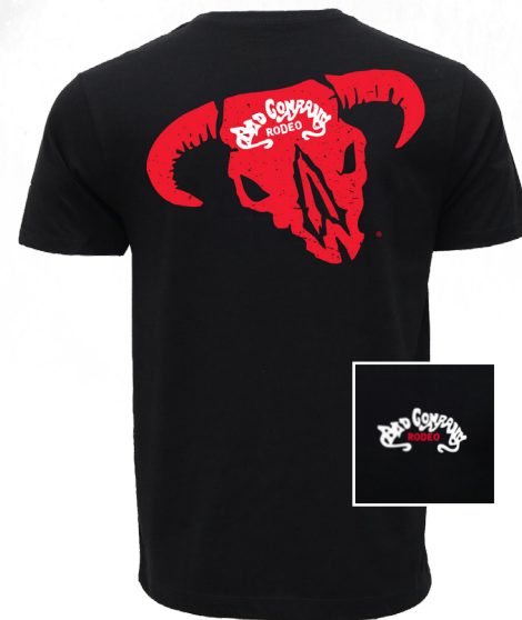
HT1831BK- Black 100% COTTON 1600/3200 S-XXL (1-2-3-2-1) 1600/3200 XXXL