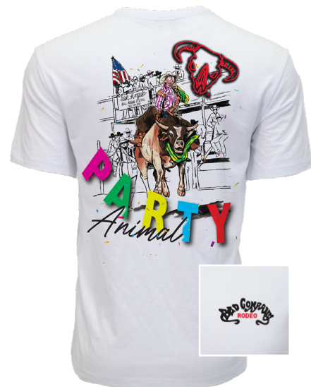
HT1833WH - White 50% COTTON / 50% POLYESTER 1600/3200 S-XXL (1-2-3-2-1) 1600/3200 XXXL YOUTH HT1833WH-Y 1250/2500 XS-XL (1-2-2-2-1)