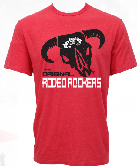
HT1834RD - Red 100% COTTON / 50% POLYESTER 1600/3200 S-XXL (1-2-3-2-1) 1600/3200 XXXL