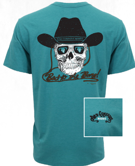
HT1835TL - Teal 50% COTTON / 50% POLYESTER 1600/3200 S-XXL (1-2-3-2-1) 1600/3200 XXXL YOUTH HT1835TL-Y 1250/2500 XS-XL (1-2-2-2-1)