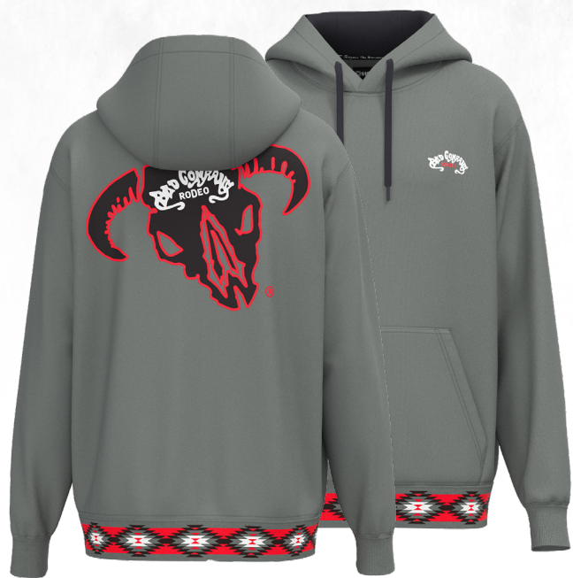
HH1401DKGY - Dark Grey 60% COTTON 40% POLYESTER 3750/7500 S-XXL (1-2-3-2-1) 4000/8000 XXXL