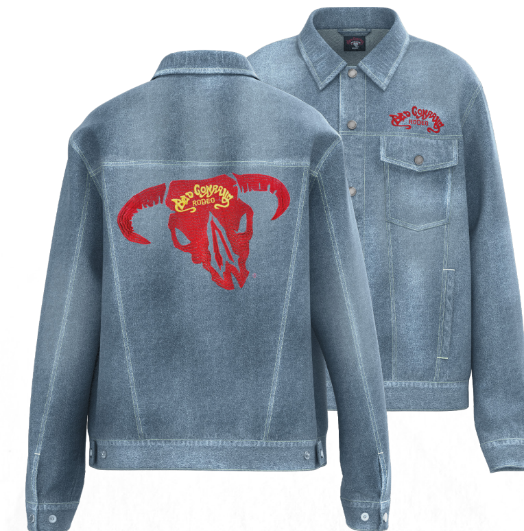
HJ153DE - Denim 100% COTTON 6500/13000 S-XXL (1-2-3-2-1) 7000/14000 XXXL