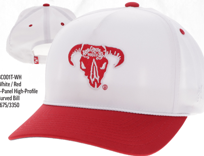
BC001T-WH White / Red 5-Panel High-Profile Curved Bill 1675/3350