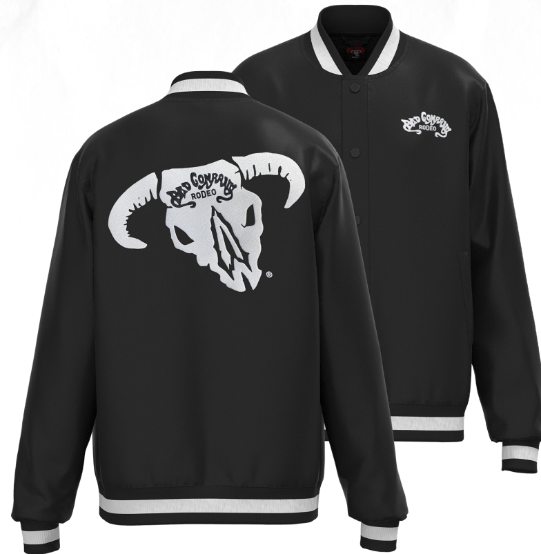
HJ152BK - Black 100% POLYESTER 6500/13000 S-XXL (1-2-3-2-1) 7000/14000 XXXL