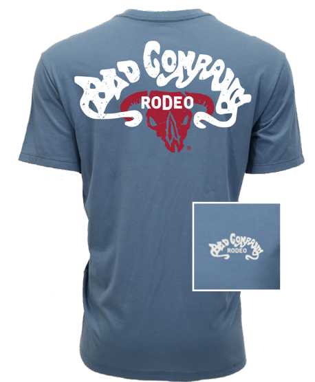
HT1832DE - Denim 50% COTTON / 50% POLYESTER 1600/3200 S-XXL (1-2-3-2-1) 1600/3200 XXXL