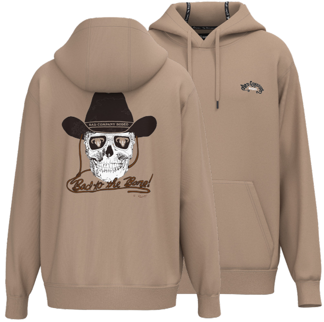
HH1405TN - Tan 60% COTTON 40% POLYESTER 3750/7500 S-XXL (1-2-3-2-1) 4000/8000 XXXL