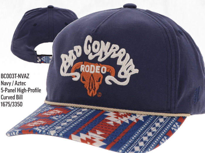
BC003T-NVAZ Navy / Aztec 5-Panel High-Profile Curved Bill 1675/3350