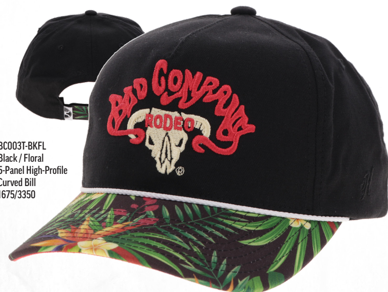
BC003T-BKFL Black / Floral 5-Panel High-Profile Curved Bill 1675/3350