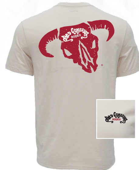
HT1831CR - Cream 100% COTTON 1600/3200 S-XXL (1-2-3-2-1) 1600/3200 XXXL