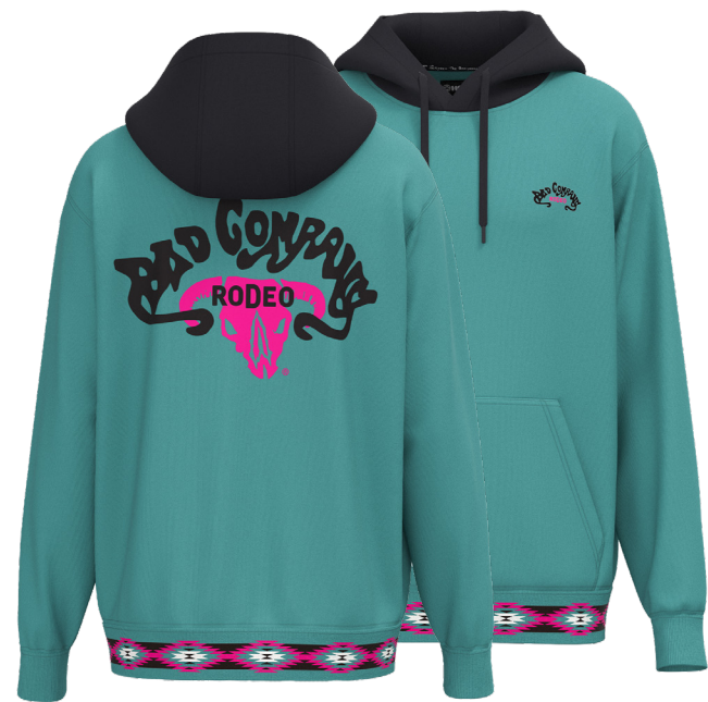
HH1402TL - Teal 60% COTTON 40% POLYESTER 3750/7500 S-XXL (1-2-3-2-1) 4000/8000 XXXL YOUTH HH1402BL-Y 3250/6500 XS-XL (1-2-2-2-1)