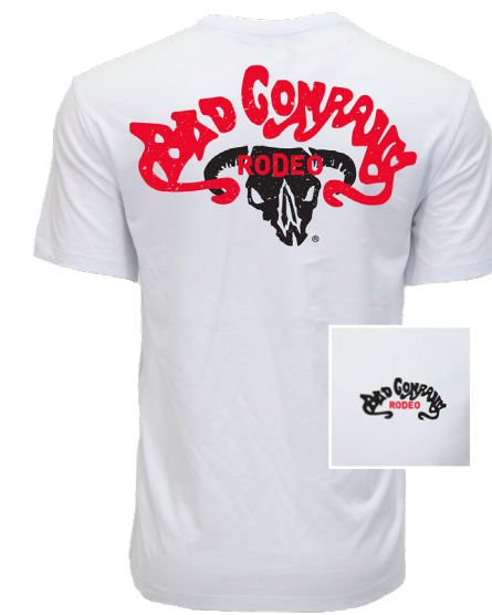
HT1832WH - White 50% COTTON / 50% POLYESTER 1600/3200 S-XXL (1-2-3-2-1) 1600/3200 XXXL