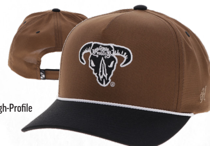
BC001T-TN Tan / Black 5-Panel High-Profile Curved Bill 1675/3350