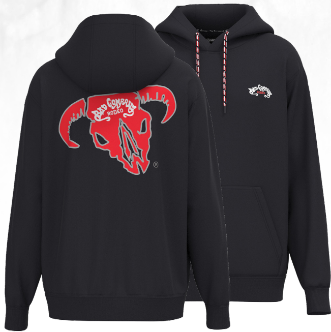
HH1401BK - Black 60% COTTON 40% POLYESTER 3750/7500 S-XXL (1-2-3-2-1) 4000/8000 XXXL YOUTH HH1401BK-Y 3250/6500 XS-XL (1-2-2-2-1)