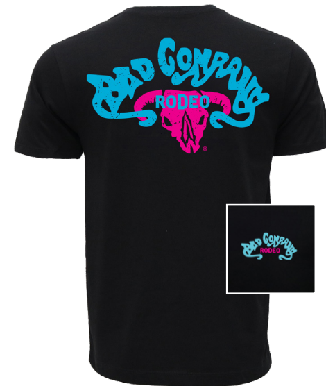
HT1832BK- Black 50% COTTON / 50% POLYESTER 1600/3200 S-XXL (1-2-3-2-1) 1600/3200 XXXL YOUTH HT1832BK-Y 1250/2500 XS-XL (1-2-2-2-1)